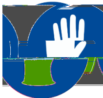
Thermally Protective Gloves